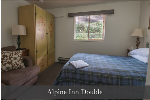
Alpine Inn Double