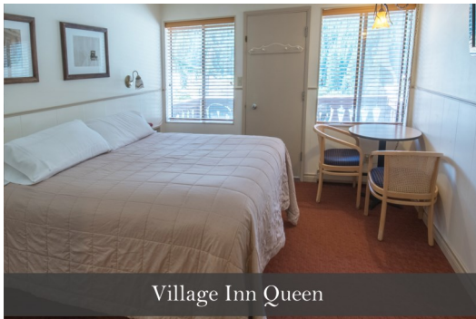
Village Inn Queen